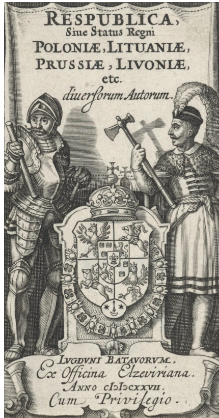
3. Pieter Serwouters, front page of Respublica, Sive Status Regni Poloniae, Lituaniae, Prussiae, Livoniae, etc. diversorum Autorum , Leiden 1627

the author's allegiance. But while the text contains an elaborate (and distinctly pro-Swedish) description of the war, 22 the Dutch ambassadors are hardly mentioned.