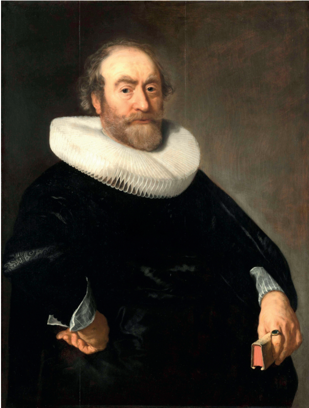
1. Bartholomeus van der Helst, Portrait of Andries Bicker , 1642; Rijksmuseum Amsterdam: SK-A-146

but as the Swedes blocked the port and took control of the Baltic coast, the grain trade suffered badly. Furthermore, crop failures had since the early 1620s led to a significant drop in supplies and, consequently, to high grain prices in Amsterdam. 13 The troublesome situation in Prussia thus directly influenced the Dutch economy.