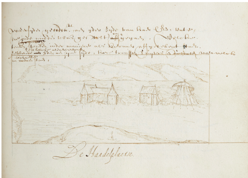
6. [Abraham Booth], De Handelsplaetse , in: id., Journal van de legatie gedaen inde Jaeren 1627. ende 1628. , [1627–28], fol. 51; Het Scheepvaartmuseum, Amsterdam: Hs-0445, inv. no. A.0145(026)

spoke a Low German dialect, for example, an interpreter was needed to communicate with the Poles. 72 In short, Poland-Lithuania is once again presented as the distant ‘other’. 73