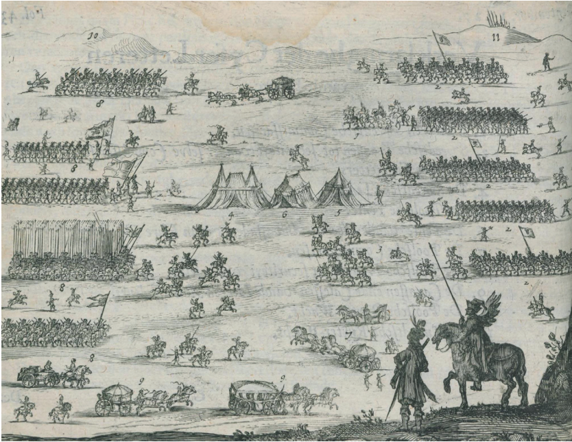
7. [Abraham Booth], [ Negotiations between the Poles and Swedes in September 1627 ], in: id., Journael, Vande Legatie, gedaen inde Jaren 1627. en 1628. , Amsterdam 1632, p. 43v; Koninklijke Bibliotheek, Den Haag: 182 G 19

A similar situation occurs when Booth describes the second round of negotiations. The printed edition contains an engraving showing the room in which the mediations were to take place (Fig. 8), including information on who would sit at what table (on the facing page). However, Booth also tells the reader that the room was never actually used for the purpose and that the mediators once again went back and forth between the Swedish and Polish representatives, who had settled in two separate farmhouses. Through this engraving, Booth seemingly takes the reader right to the negotiating table, offering an inside look at the diplomats' workshop, but all the while he says nothing about what was actually going on.