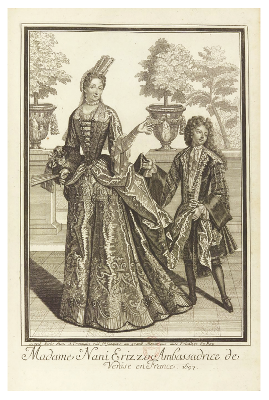
3. Ambassadress Nani Erizzo, Recueil de Modes , 7 vols (Paris, 1750), IV, fol. 208, engraving by Nicolas Arnoult.

child in service to God, and the Republic with France.<sup>75</sup> Rather than the embassy chapel signifying any potential discord with the host state, this ceremony in Versailles' Chapelle Royale symbolised royal favour. Furthermore, the ambassadresses' courtly and cultural role is shown in Madame Nani-Erizzo's portrait among the fashion plates of the aristocratic women of Versailles.