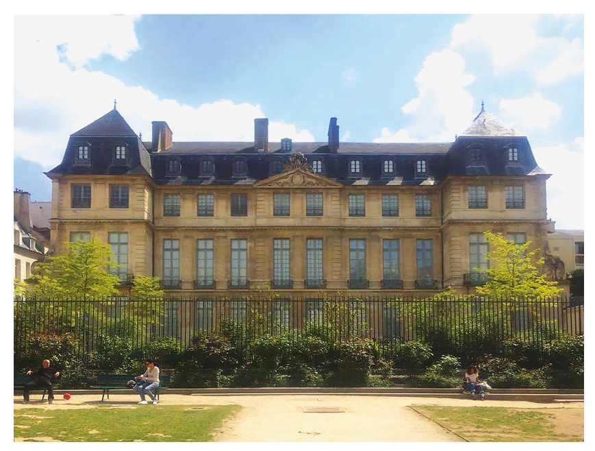
4. Hôtel Salé, garden façade